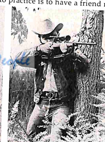
A. Sitting Position. Note how the B. Standing Position. Bracing hunter's elbows and legs provide yourself against something helps steady your rifle.

If you have the facilities, try shooting at a target that's shaped like a deer from different distances - and different angles. Another good way to practice is to have a friend roll