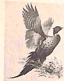
Cover by Fred Sweeney