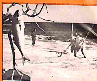
page 51: blues in the surf—find out how it's done in N. Carolina