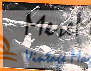
page 42: find out how to hunt the backwoods for big deer