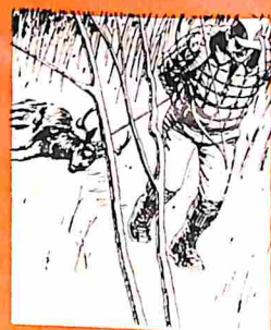
page 46: deer-hunting tips from Dave Harbour