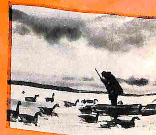
page 56: a memory of goose-hunting majesty gone by