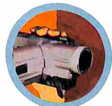
ILLUSTRATION FOR TIME BY JOHN RITTER

64 Byte-size chunks of fame are now within the grasp of any geek with a camcorder, a computer and an e-mail account