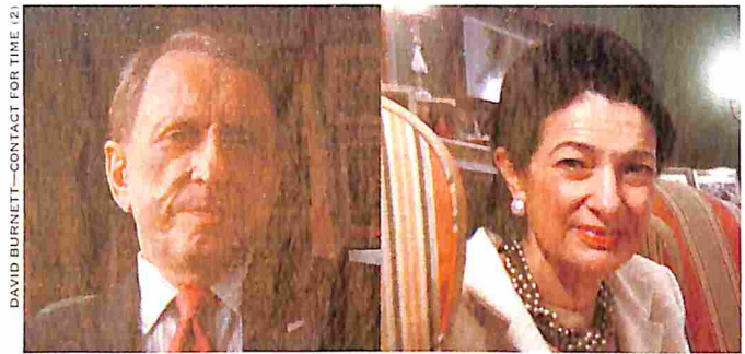
24 Pennsylvania bulldog Arlen Specter and Maine centrist Olympia Snowe are both on our list of 10 Best Senators. (Don't worry, we also compiled a list of the Five Worst)