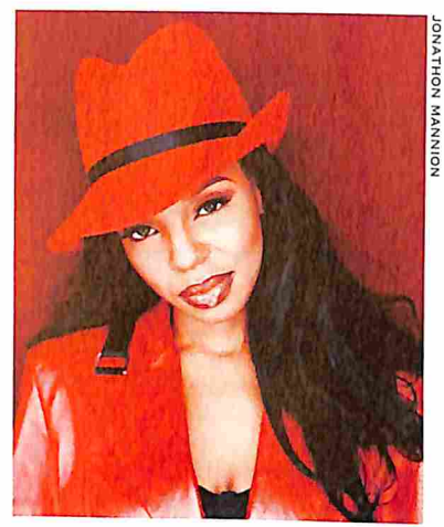
The Hottest and Hardest: Rah Digga is not typical hip-hop (see The ARTS)