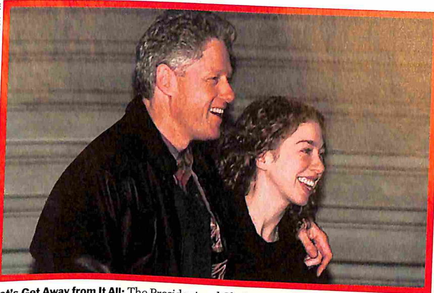
Let's Get Away from It All: The President and Chelsea on their way to Camp David