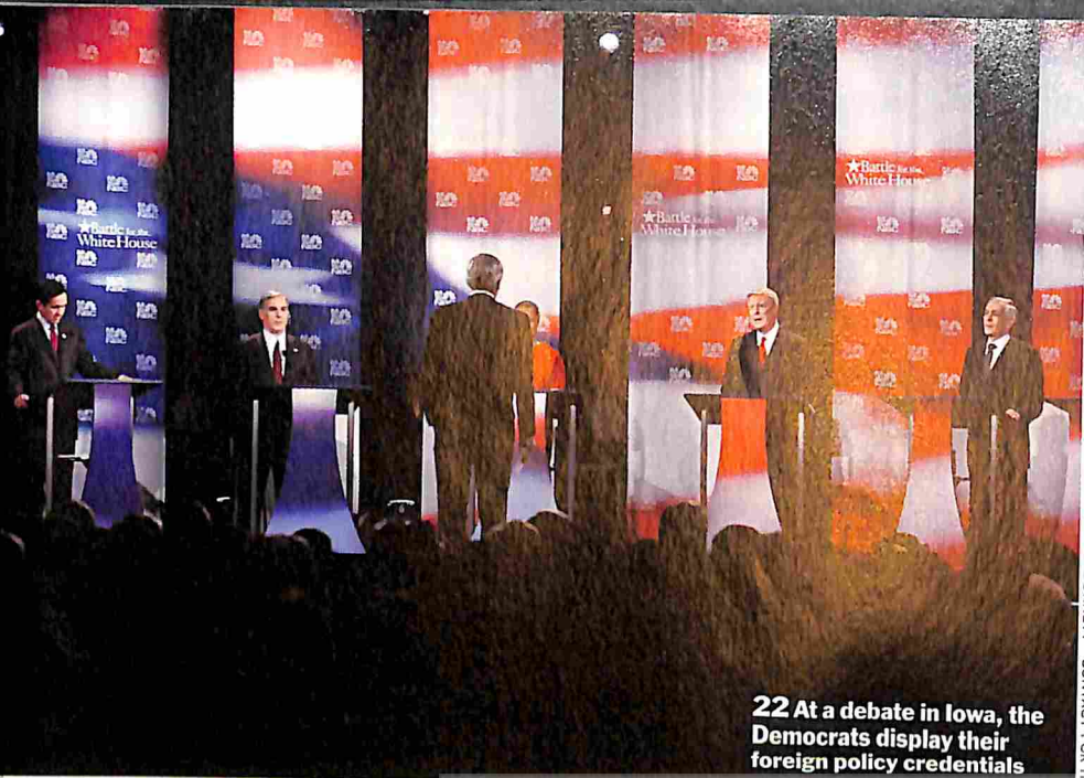
22 At a debate in Iowa, the Democrats display their foreign policy credentials

COVER: Illustration for TIME by Ed Gabel