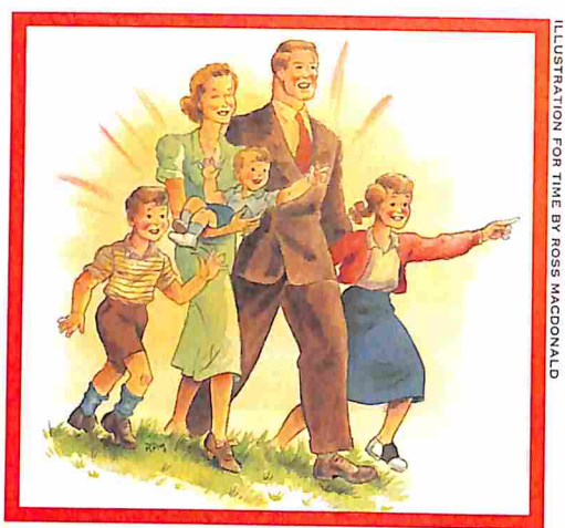
Backlash: Patients unhappy with their HMOS demand their rights (see MANAGED CARE 1998)