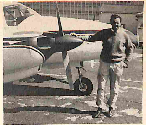
PILOT HUGHES & PLANE

had the classic gambler's experience. On the way to the airport, he stopped in the lobby for a last turn at roulette, bet the birthdates of his six children, won, kept on winning. "I couldn't lose," he recalls, "and I had to leave." Finally he bet his own birthdate—and lost all.