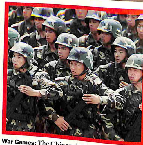
War Games: The Chinese have the technology, but how serious is the threat? (see COVER)