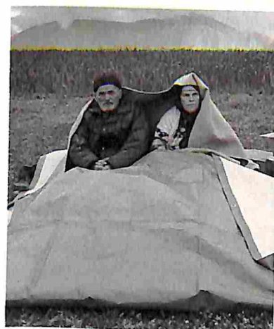
Refugees: The flotsam and jetsam of war in Kosovo (see WORLD)