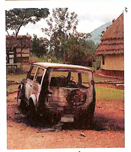
Africa Burning: A complex war rages among former allies (see WORLD)