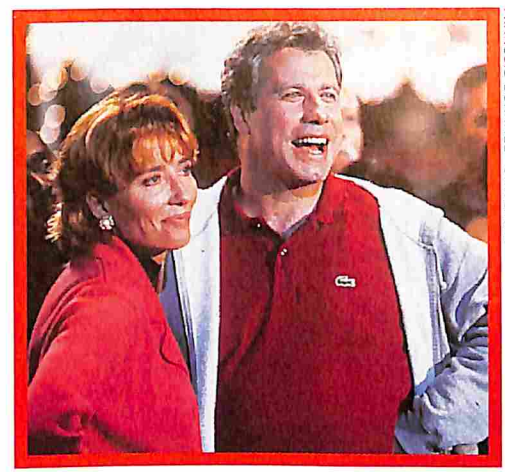
Celluloid Bill: White House fact and fiction coexist in a new movie (see COVER)