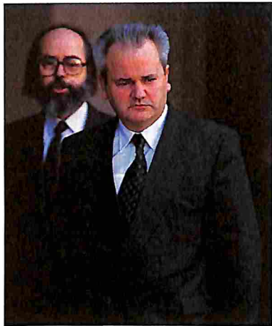
Taking the Heat: Milosevic feels the pressure on Kosovo (see WORLD)