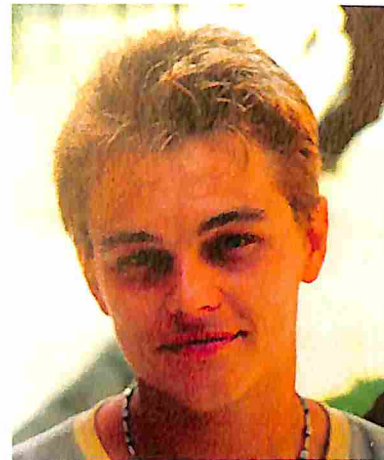
Thai-tanic! Is life The Beach for Leonardo DiCaprio? (see THE ARTS)