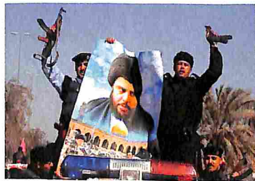
22 Iraqi policemen with a poster of radical Shi'ite Muqtada al-Sadr

FORUM: Experts discuss the roots of sectarian violence in Iraq .... 25