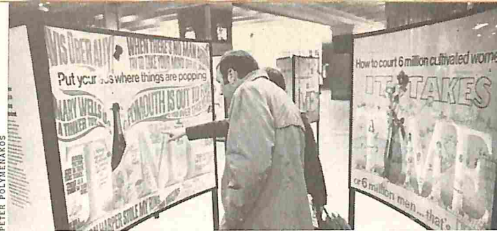
GRAFFITI & FANS AT GRAND CENTRAL

© 1967 TIME INC. All rights reserved. Reproduction in whole or part without written permission is prohibited. Principal office Rockefeller Center, New York, New York 10020.