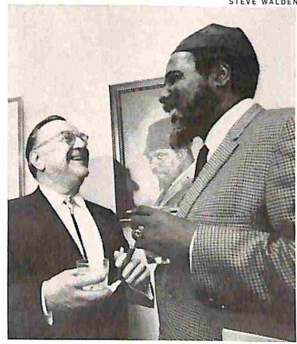
ARTIST CHALIAPIN & MONK