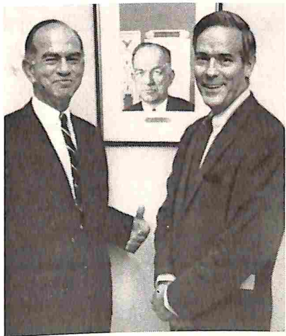
FULBRIGHT & ARTIST ROBERT VICKREY