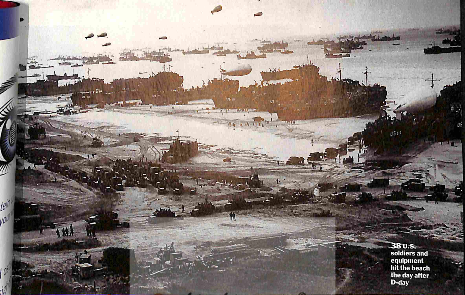
38 U.S. soldiers and equipment hit the beach the day after D-day