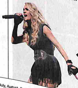
Underwood, page 56

60 | 9 Questions with former Nightline anchor Ted Koppel