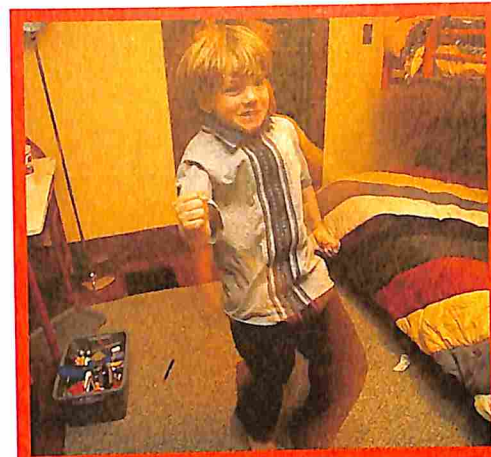
The Ritalin Generation: What does use of the drug say about us—and our kids? (see COVER)