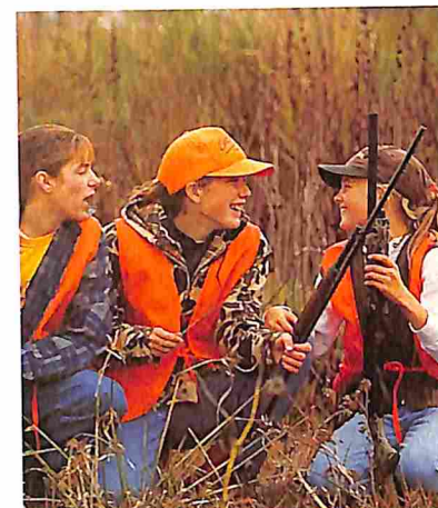
In Waiting: Girls at a California youth hunt (see SCIENCE and SOCIETY)