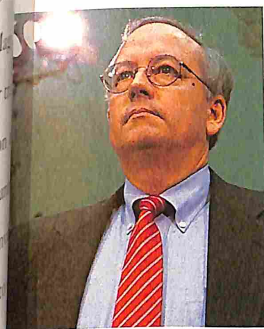
Spotlight on Starr: He takes center stage—ho-hum (see NATION)