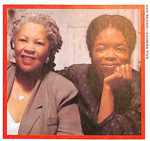
Teamwork: Toni Morrison and Oprah Winfrey, the forces behind a potent film (see COVER)