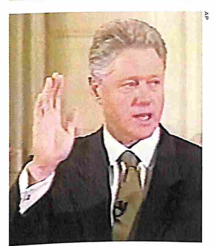
Tale of the Tape: Ken Starr's video creates dismay—over Starr (see NATION)