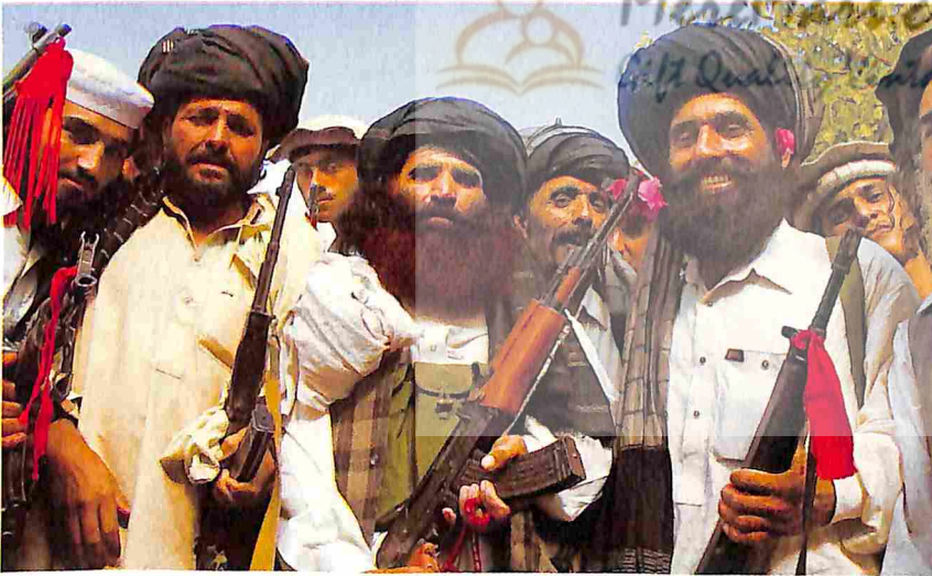
36 ▲ Pakistani tribesmen show off weaponry despite a little-observed ban on public displays of firearms