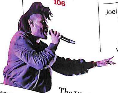
The Weeknd, page 112

9 Questions with comedian Mindy Kaling 120