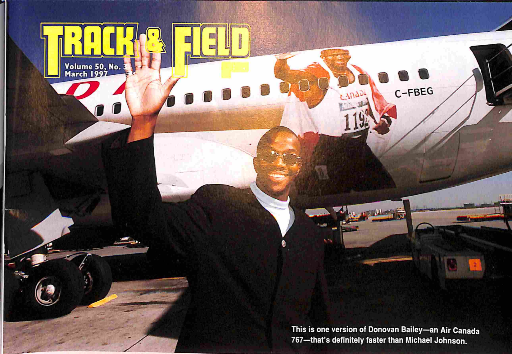
This is one version of Donovan Bailey—an Air Canada 767—that's definitely faster than Michael Johnson.