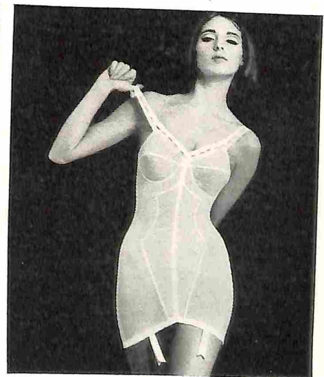
Stretchbra Corselette. My, how you've grown, Stretchbra. All cling and curve, with panels, too. Nylon and Lycra spandex 18.50.