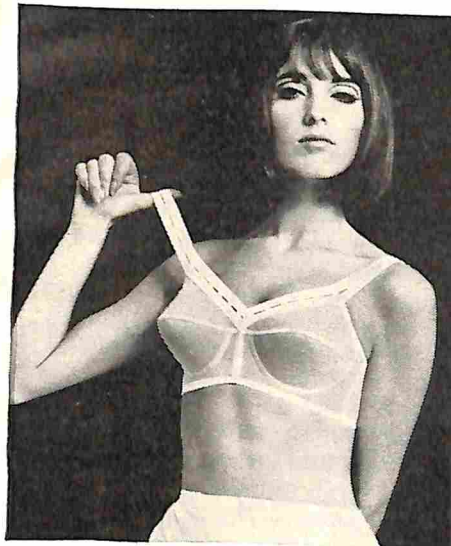
Stretchbra™ Bandeau. The original Stretchbra. It stretches everyplace a bra should stretch, but never did before. 5.95.