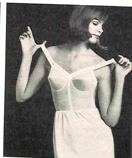
Stretchbra Slip. This little Stretchbra is also a slip. Or is this little slip also a bra? Antron® nylon tricot below the belt. 12.95.