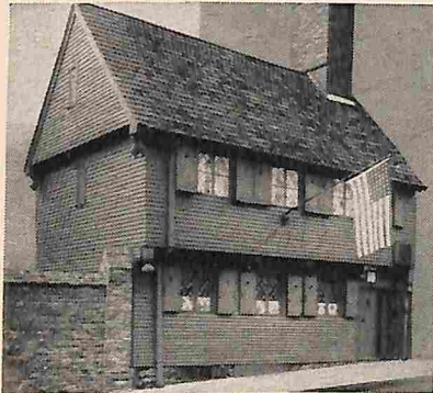
North Square, Boston.