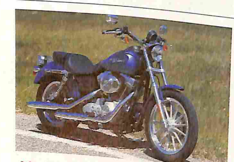
90 2005 FXD SUPER GLIDE Sporting weapon and affordable Big Twin