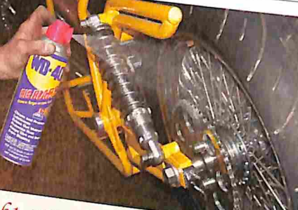
161 WD-40 BIG BLAST A protective fogger for your chrome