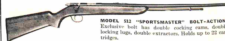
MODEL 512 "SPORTSMASTER" BOLT-ACTION. Exclusive bolt has double cocking cams, double locking lugs, double extractors. Holds up to 22 cartridges.