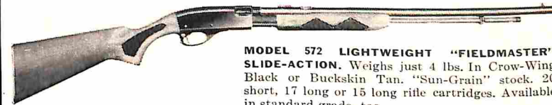
MODEL 572 LIGHTWEIGHT "FIELDMASTER" SLIDE-ACTION. Weighs just 4 lbs. In Crow-Wing Black or Buckskin Tan. "Sun-Grain" stock. 20 short, 17 long or 15 long rifle cartridges. Available in standard grade, too.