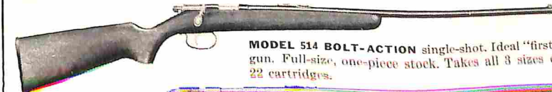
MODEL 514 BOLT-ACTION single-shot. Ideal "first" gun. Full-size, one-piece stock. Takes all 3 sizes of 22 cartridges.