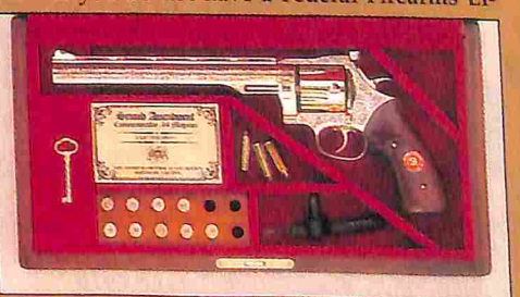
Optional American Walnut Display Case with glass lid. 18"x10"x3". (Bullets not included.)

To reserve, call toll free, 1-800-368-8080, or return the Reservation Request. When you reserve, you will be made a Member of the Foundation. If you do not have a Federal Firearms Li-