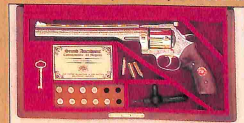
Optional American Walnut Display Case with glass lid. 18"x10"x3". (Bullets not included.)

The Second Amendment .44 Magnum is available exclusively from The American Historical Foundation. To reserve, call toll free, use the Reservation Request or visit. When you reserve, you will be made