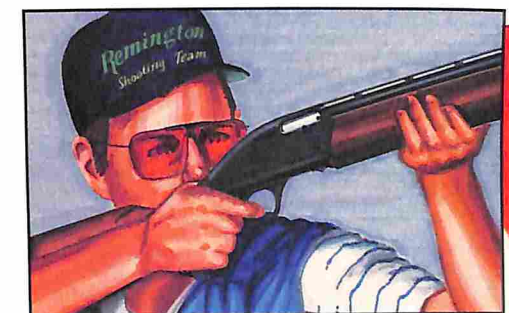
Vermilion: For maximum contrast in flat light. Designed for hunting.