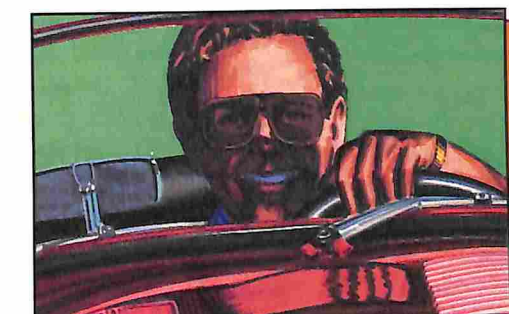
Blue Light Blocking: For general purpose use. High level of blue light spectrum.