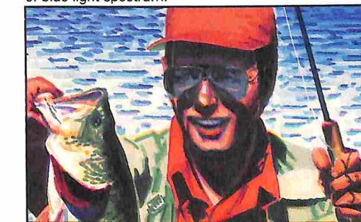
CR-39 Polarized: For crystal clear protection against glare and distortion. Cut from oversized blanks, these laminated lenses are the absolute best. For fishing, driving, and other outdoor activities.

CALL TOLL FREE AND ORDER TODAY! 1-800-445-2222 REMINGTON SPORT MASTER INTERCHANGEABLE LENS SYSTEM