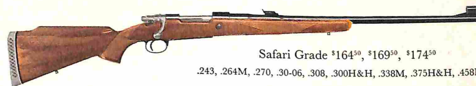
Safari Grade $164 50 , $169 50 , $174 50 .243, .264M, .270, .30-06, .308, .300H&H, .338M, .375H&H, .458M

Whether that gleam in your eyes signifies a trip to the bush of Mozambique, the plains of Wyoming or to the next county for a big four-pointer, make it a better hunt with a Browning High-Power. It pledges absolute dependability and fine accuracy... It promises fast handling qualities and the ability to take tough treatment... The skill of rare craftsmanship is so tastefully displayed, its masculine beauty equals indeed its serviceability.