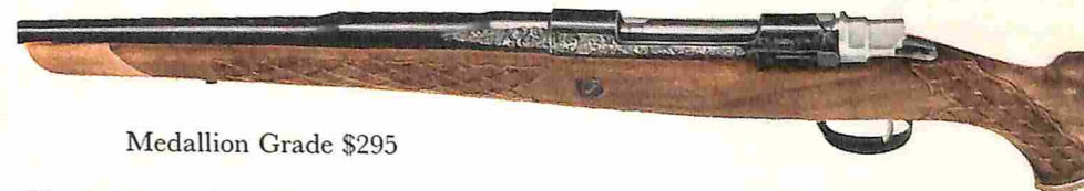
Medallion Grade $295

Select walnut stock in Monte Carlo design with cheek piece, individually hand-bedded, hand-checked and finished... Streamlined, highly polished action... Specially contoured, chrome vanadium steel barrel... Silent, three-position, sliding safety... Rear sight with quick, positive, horizontal and vertical adjustments and removable base... Smooth, crisp trigger pull... Hinged floor plate and trigger guard hand-engraved in black and gold.