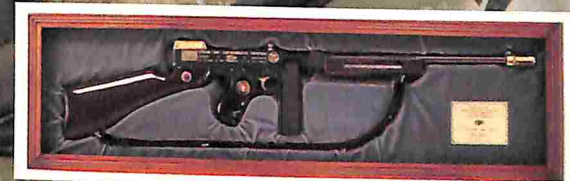
Optional walnut display case.

front sight. Your finger rests on the 24-karat gold plated trigger. Even the special, black, military style sling is affixed to swivels which are 24-karat gold plated and mounted with four 24-karat gold plated screws.