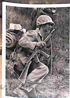
Korea — "The front lines of freedom." President Ronald Reagan