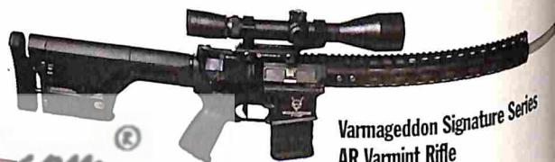
Varmageddon Signature Series AR Varmint Rifle

A look at more great guns and shooting products