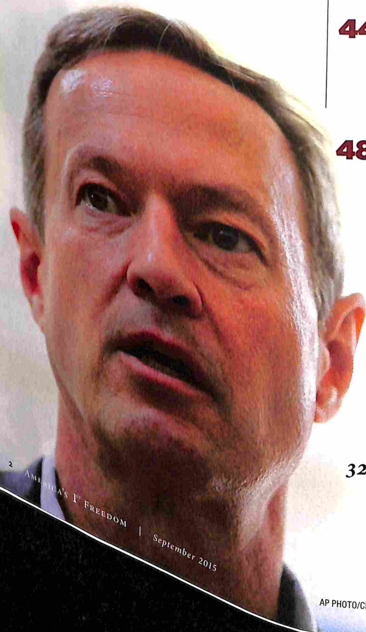
32 FORMER MD. GOV. MARTIN O'MALLEY

Presidential hopeful Martin O'Malley's relentless pursuit of gun control could make Hillary Clinton's virulent anti-gun views look tame in comparison.