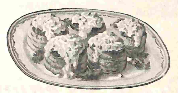
CREAMED STAR HAM PATTIES. Serve Ham.

ARMOUR AND COMPANY, Chicago Armour and Company, Limited London, England