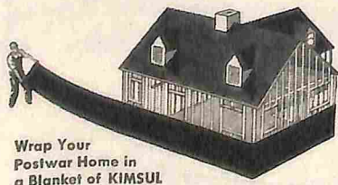
Wrap Your Postwar Home in a Blanket of KIMSUL

*KIMSUL (trade-mark) means Kimberly-Clark Insulation