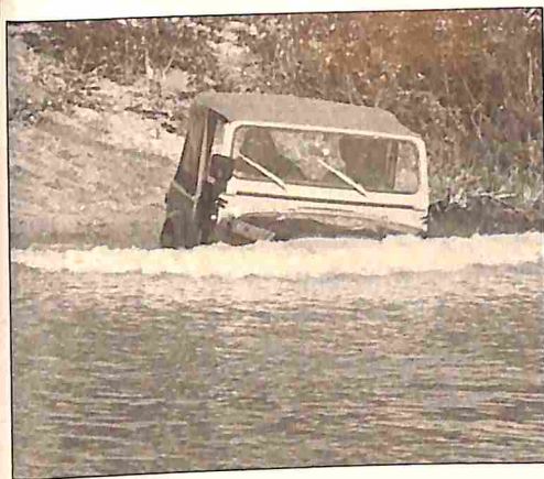
Take 'er down to periscope depth, Mr. Sherman. Page 88