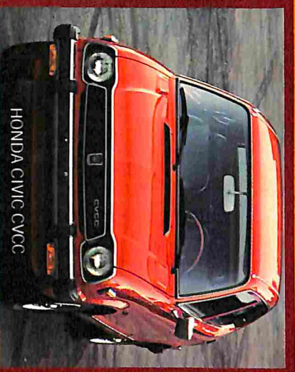
HONDA CIVIC CVCC