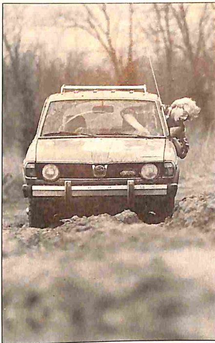
Damn the cow pies and full speed ahead. Page 39