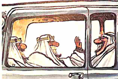
Why are these men smiling? Page 73