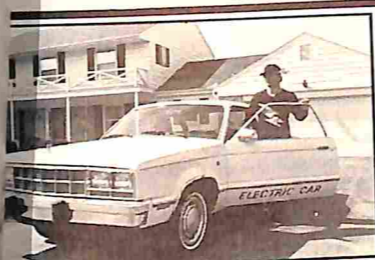
Ohm, sweet ohm.