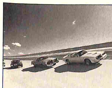
Blue sky, no speed limit.