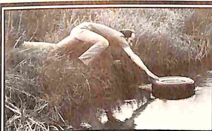
Good thing it can tread.