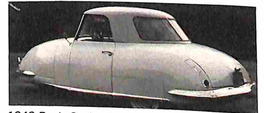
1949 Davis 3-wheeler . . . $7,500, p. 68