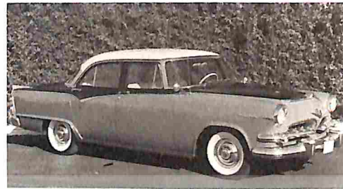
1955 Dodge Custom Royal . . . p. 32