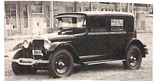
1925 Wills Sainte Claire . . . p. 38

SUBSCRIPTION RATES , monthly frequency: U.S. 12 issues $18.00, 24 issues $34.00, First Class 12 issues $40.00, 24 issues $78.00, other countries 12 issues $20.00, 24 issues $38.00. Air mail 12 issues $57.00, 24 issues $110.00. A free 20-word ad is given with each subscription or renewal for use any time during subscription term. Words in excess of 20 are 22¢ each.