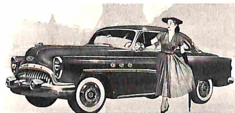
Those "super special" Buicks . . . p. 40