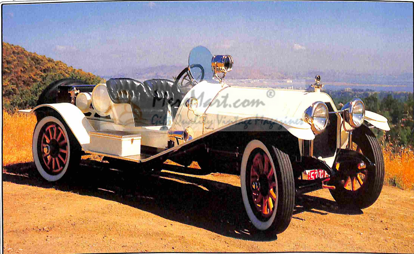
1914 Mitchell Big Six Raceabout