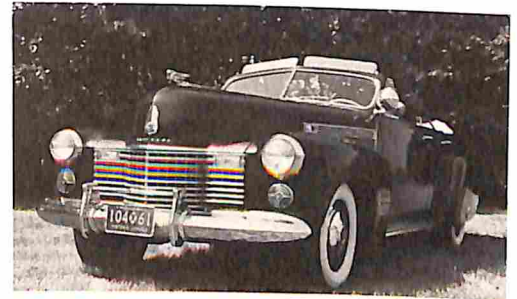
1941 Cadillac conv. sedan . . . p. 22