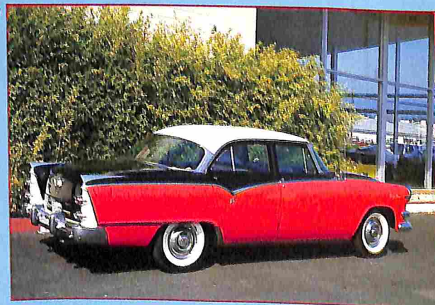
1955 Dodge Custom Royal Sedan