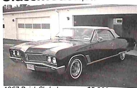
1967 Buick Skylark conv. ... $5,900, p. 88