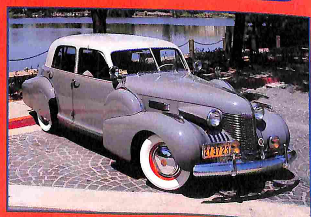
1940 Cadillac Sixty Special