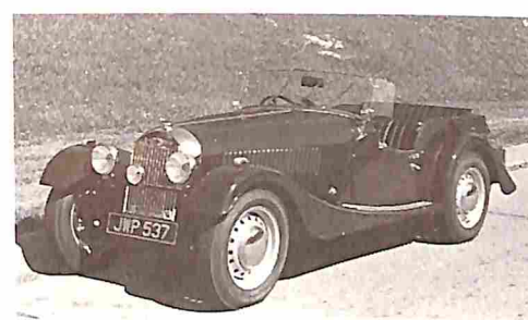
1951 Morgan Plus 4 ... p. 48