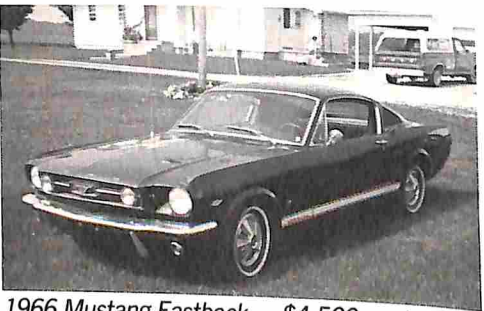
1966 Mustang Fastback ... $4,500, p. 123