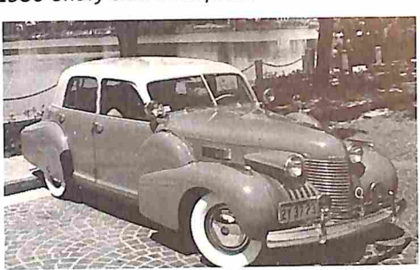
1940 Cadillac Sixty ... p. 32