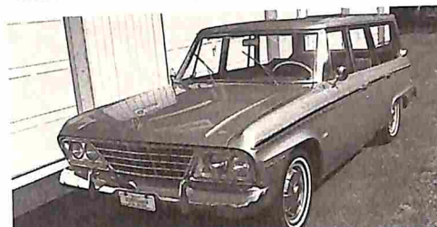
1964 Studebaker Wagonaire ... 34