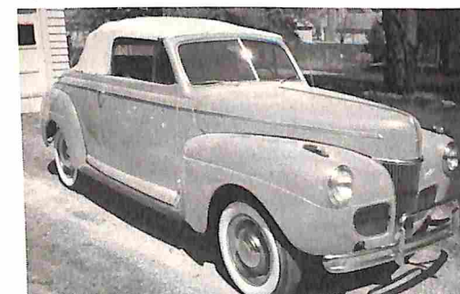
1941 Ford convertible, $13,850 ... p. 107