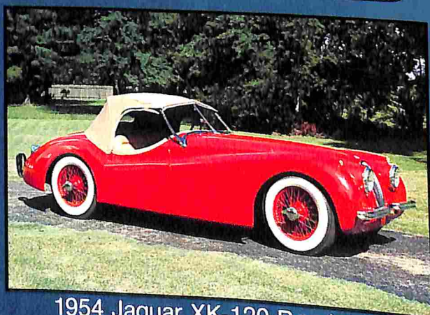
1954 Jaguar XK-120 Roadster