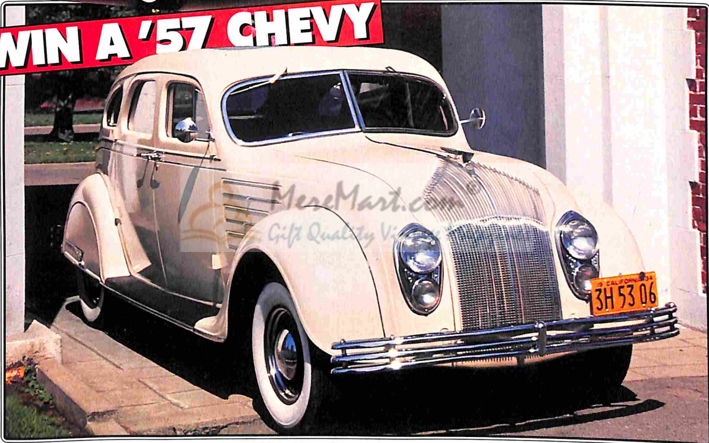
1934 Chrysler Airflow Sedan