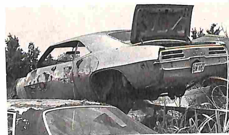
City Wrecking, Waco, Tex. ... 28