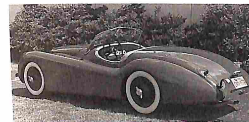
1954 Jaguar XK 120 roadster ... 48