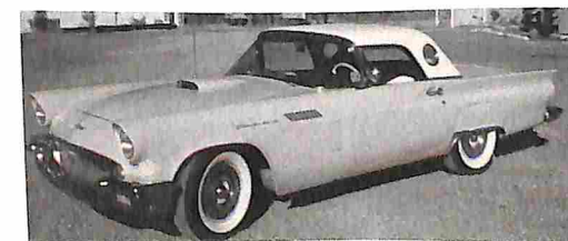
1957 Ford Thunderbird, $32,000 ... 116