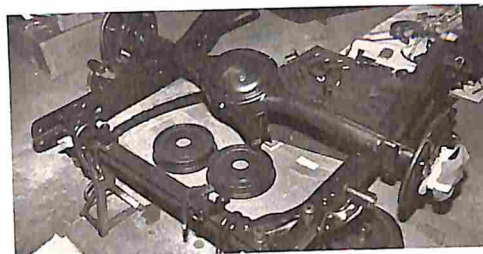
Chassis reassembly ... 6

P.O. Box 482 • Phone 513-498-0803 • Sidney, OH 45365