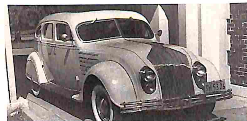
1934 Chrysler Airflow ... 20