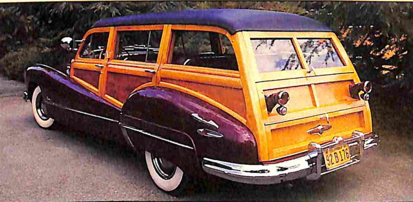
'47 Buick Estate Wagon ..... 8