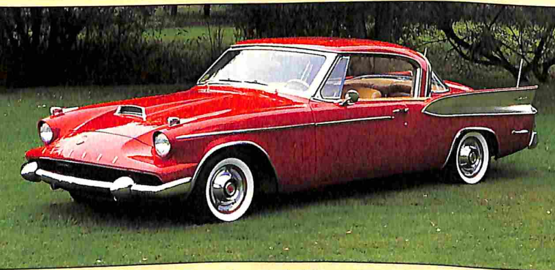
'58 Packard Hawk ..... 52