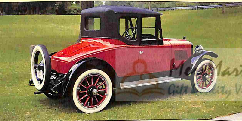
'22 Hupmobile ..... 28