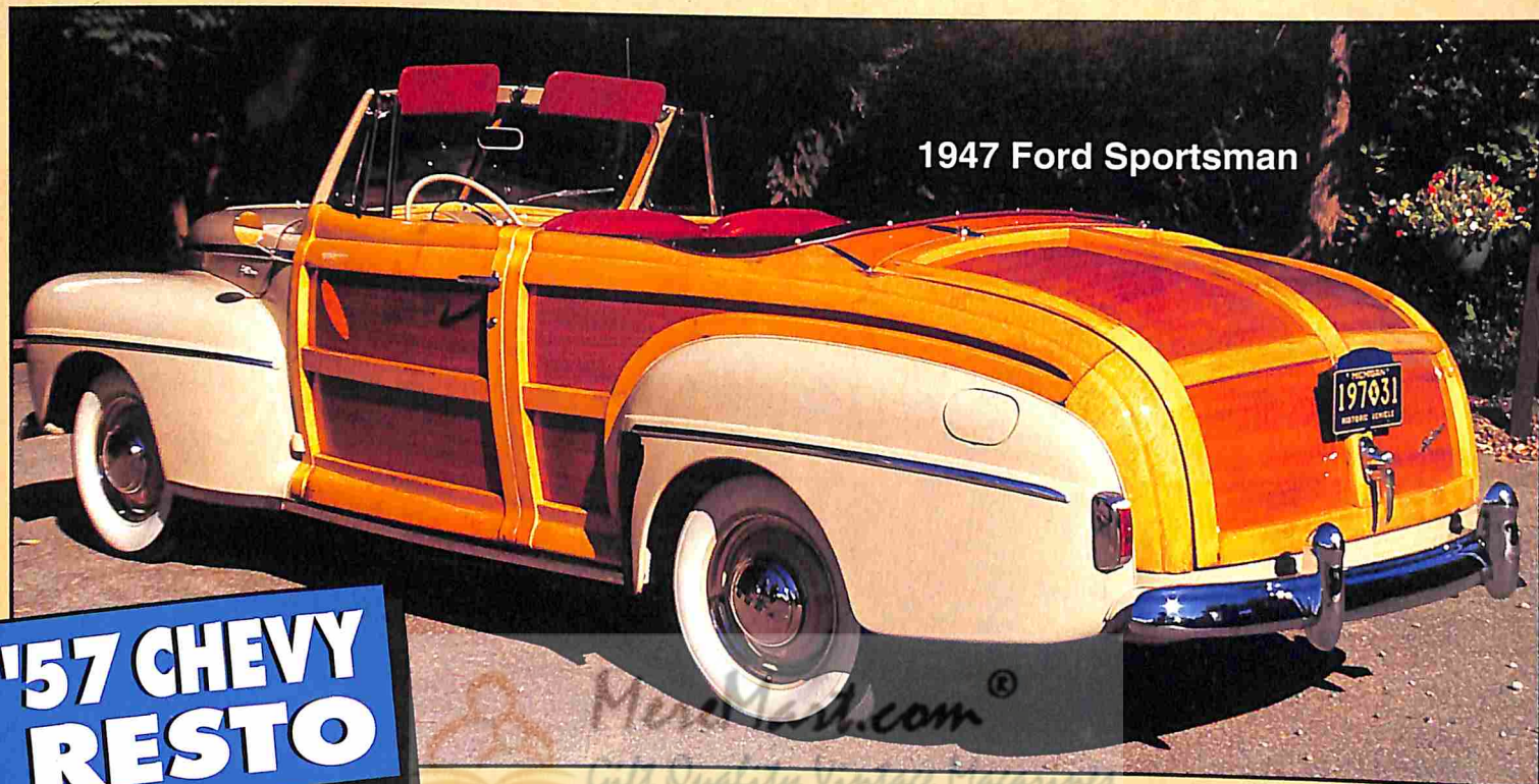
1947 Ford Sportsman