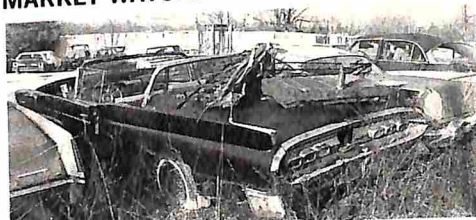
Kentucky salvage yard ... 13