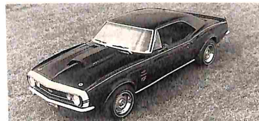
1967 Yenko Camaro 427 ... 32