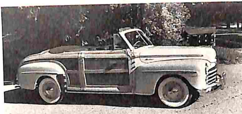
1947 Ford Sportsman convertible ... 20

P.O. Box 482 • Phone 513-498-0803 • Sidney, OH 45365