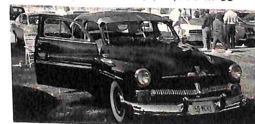
1950 Mercury sedan, $12,950 ... 104