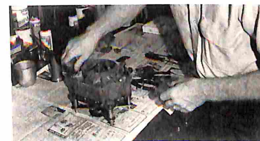
Overhauling Peggy Sue's carb ... 62