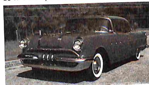
1955 Pontiac Star Chief ... 48