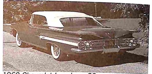
1960 Chevrolet Impala ... 22