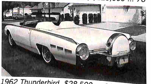
1962 Thunderbird, $28,500 ... 117