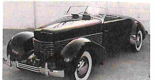
1936 Cord 810 Sportsman, $125,000 ... 76