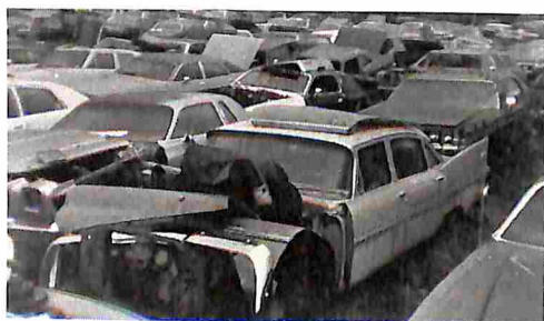
McCoy's Auto & Truck Wrecking ... 16