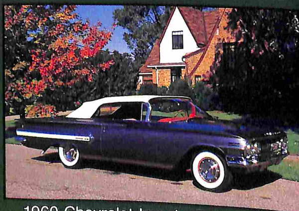
1960 Chevrolet Impala Convertible