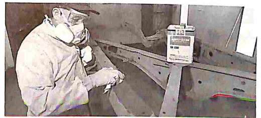
Peggy Sue: Frame painting ... 54