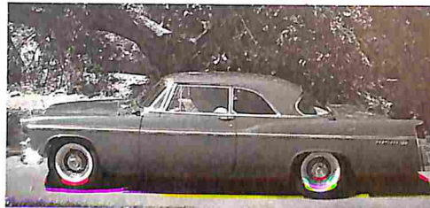
1956 Chrysler 300-B ... 46