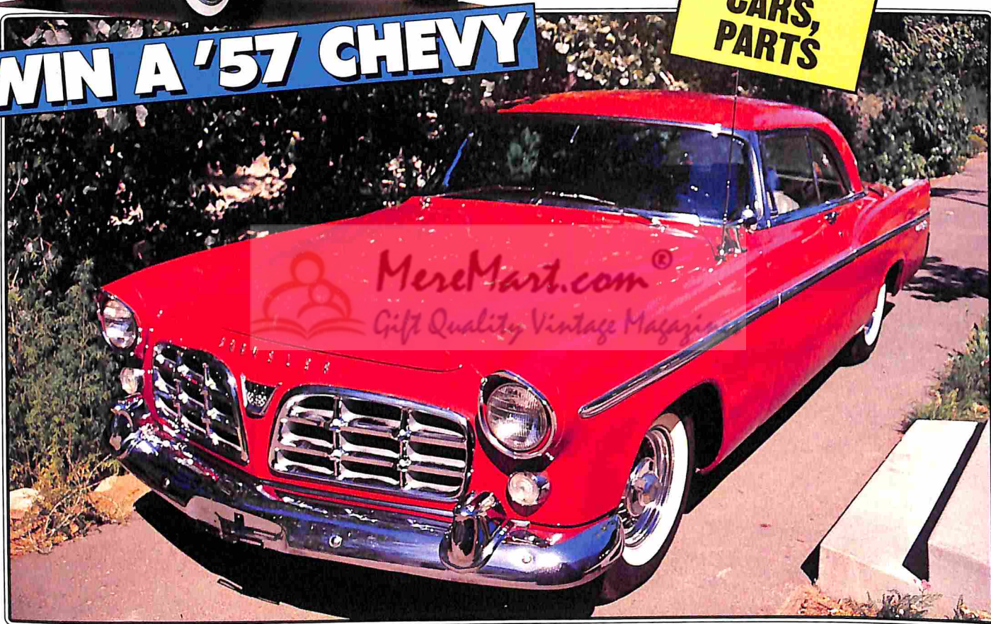
1956 Chrysler 300-B Sport Coupe