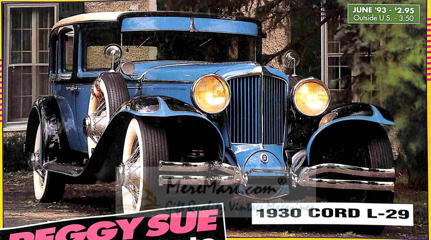
1930 CORD L-29