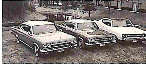
1965-67 AMC Marlins ... 20