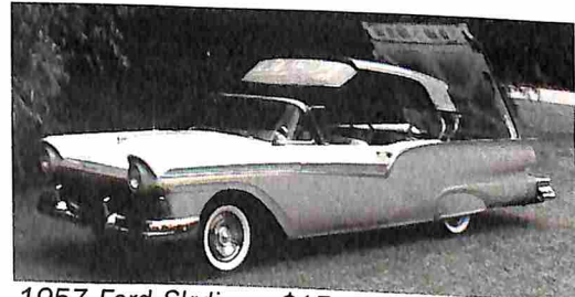
1957 Ford Skyliner, $15,900 ... p. 115