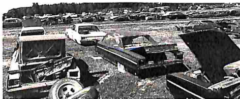
Missouri Mopar yard ... 42