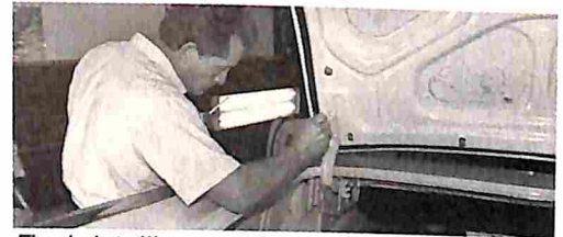
Final detailing ... 28