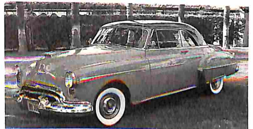
1950 Olds 88 ... 48