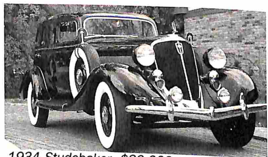
1934 Studebaker, $30,000 ... p. 137